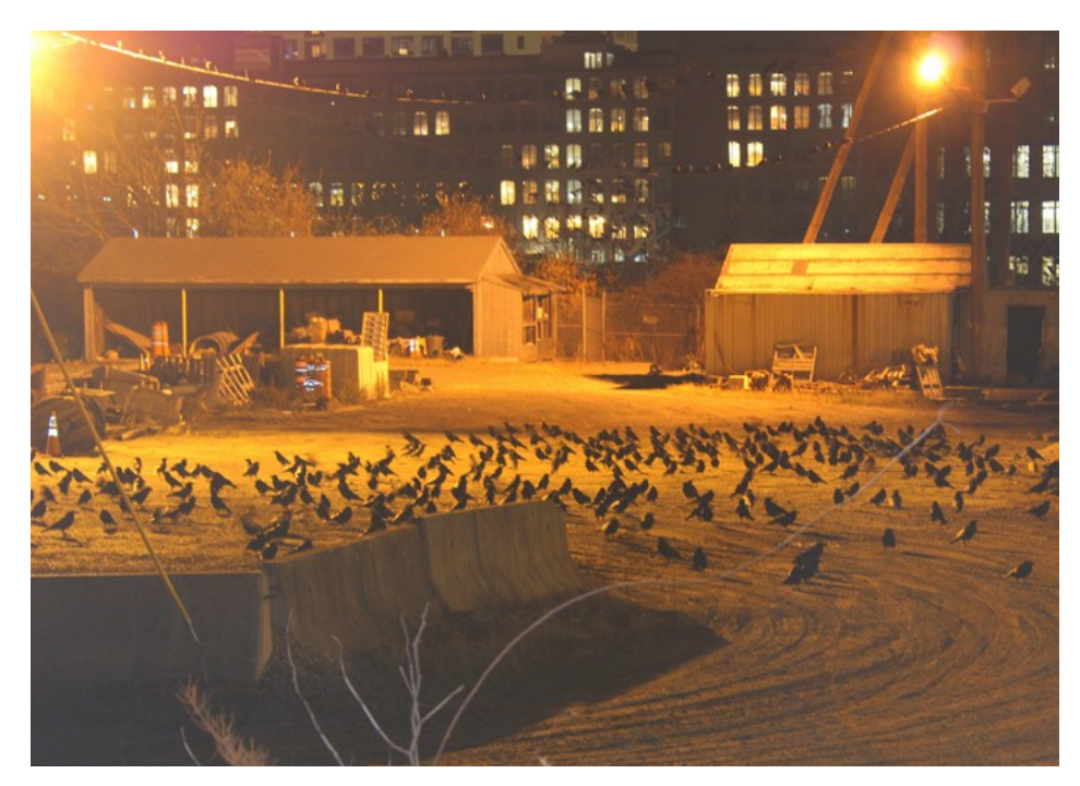
The National Grid substation on South Canal Street is one of the crows' staging areas. Crows cover the ground, fill the trees, and perch on the utility wires.

not roost together, and independently leave the roost in the morning (Caccamise et al.1975).