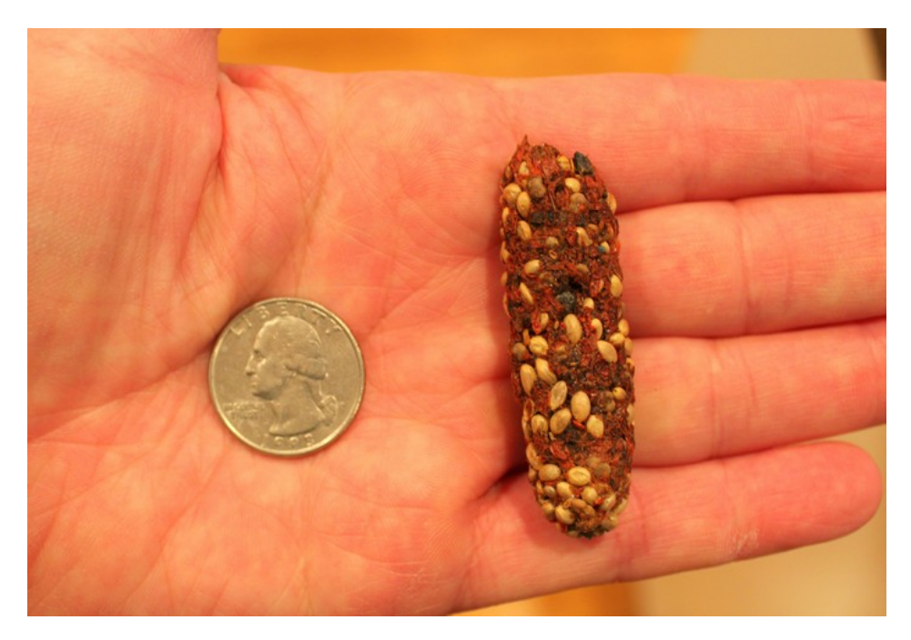
Crow pellet found at the Lawrence Winter Roost.