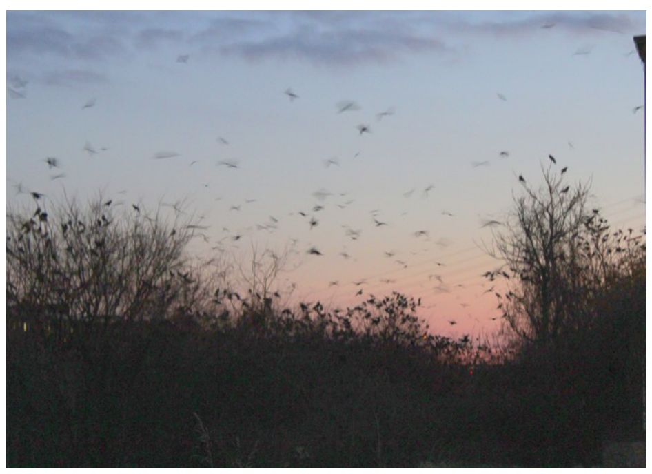
Crows leave the roost before sunrise, flying over the Merrimack River.

But just an hour before sunrise, when the east was becoming faintly lighted, the crows suddenly commenced awakening, and at the same time commenced cawing. The few who led the measure were within one or two minutes joined by the full chorus of 300,000 or more voices, each apparently striving to be heard by all the rest. Never before had I realized the almost infinite possibility of the crow's variable caw in the production of discords. This great noise, which the poetic soul of Audubon conceived to the "thanksgiving" and "consultation," was kept up for twenty minutes before any movement was discernible. (Edwards 1888)