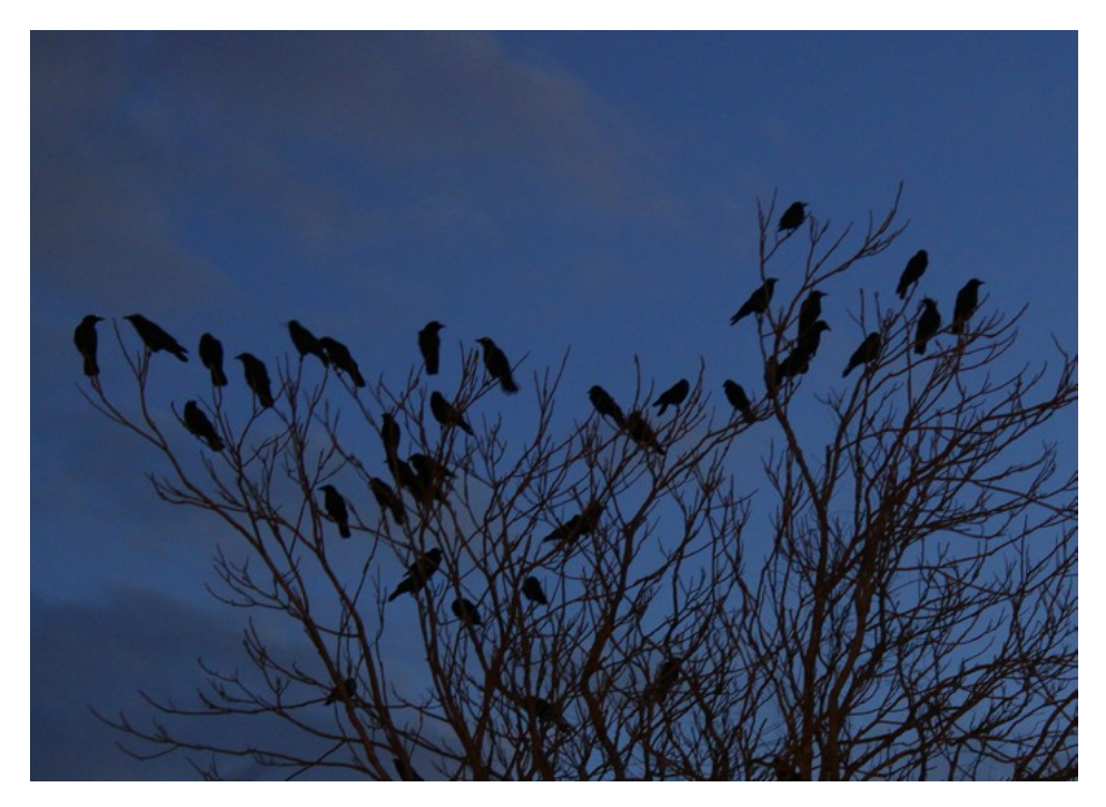
Silence falls when the crows settle into their overnight roost.

the east of the roost and gather on either the south or north side of the river—in trees, in parking lots, on buildings, and on the ground. One cloudy night, we found them on the hill to the east of the Lawrence General Hospital. The noise is always considerable. There is constant movement of swirling flocks around the staging area.